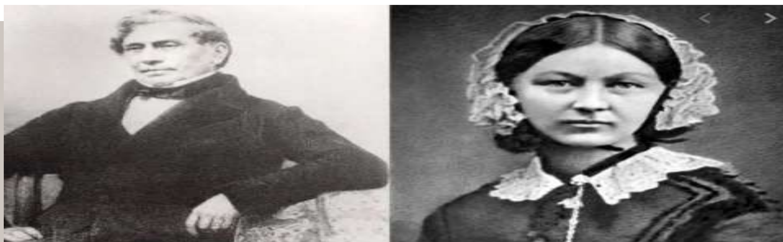
James Miranda Stuart Barry (c. 1789 – 25 July 1865)