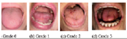
The mucositis classification of WHO was examined by professional dentist.